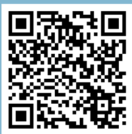
Kolar Toyota ALS Fishing Tournament May 29 - 30, 2026

MAKE A DIFFERENCE. HAVE FUN. REGISTER TODAY.